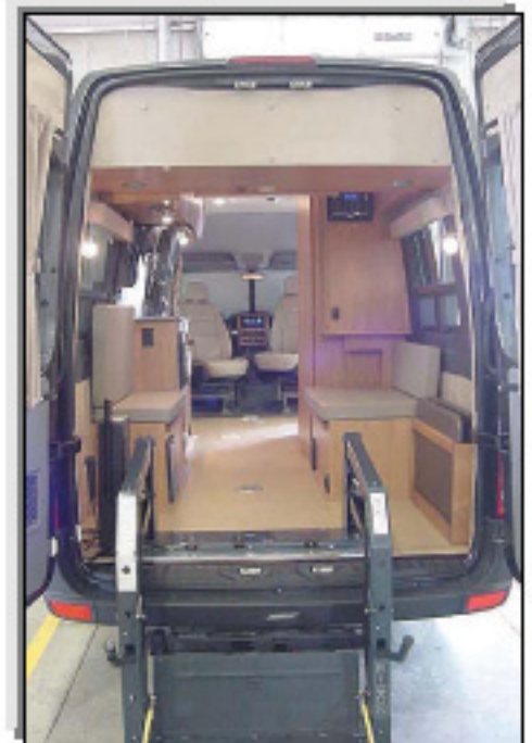
Rear platform lift access