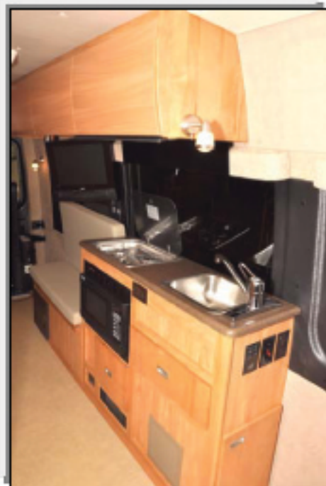
Galley with portable refrigerator