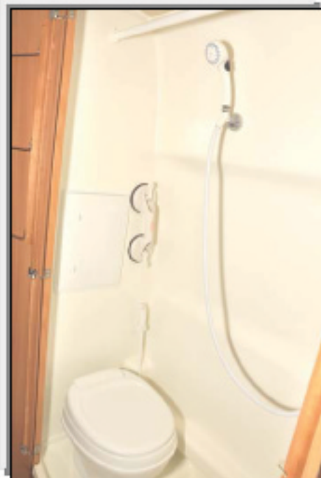
Convenience of a bathroom